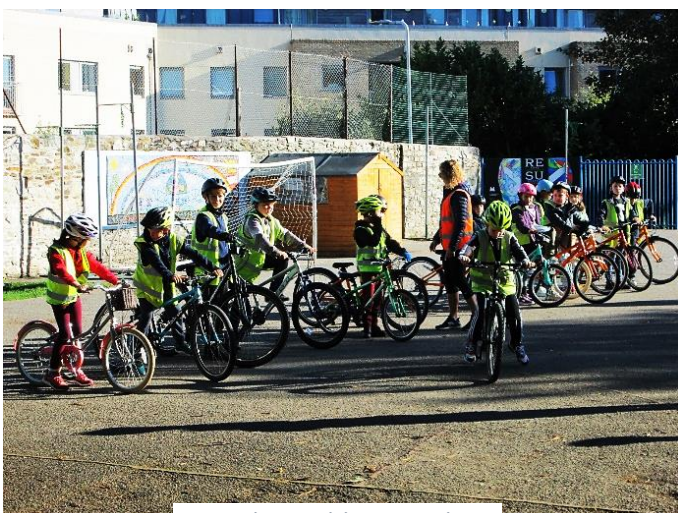
Y5 Bikeability session

Year 5 took part in Bikeability sessions last week. This scheme aims to give children the practical skills and confidence to cycle safely on our busy roads.