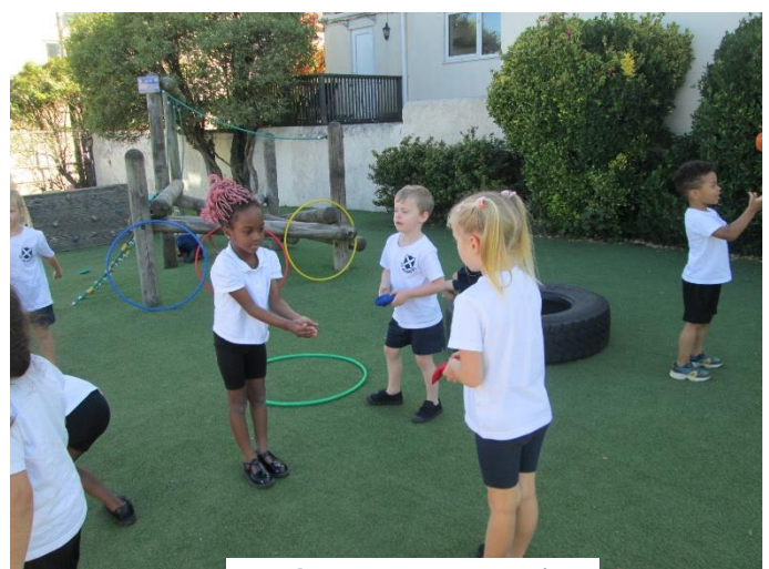
Y1 Outdoor PE session